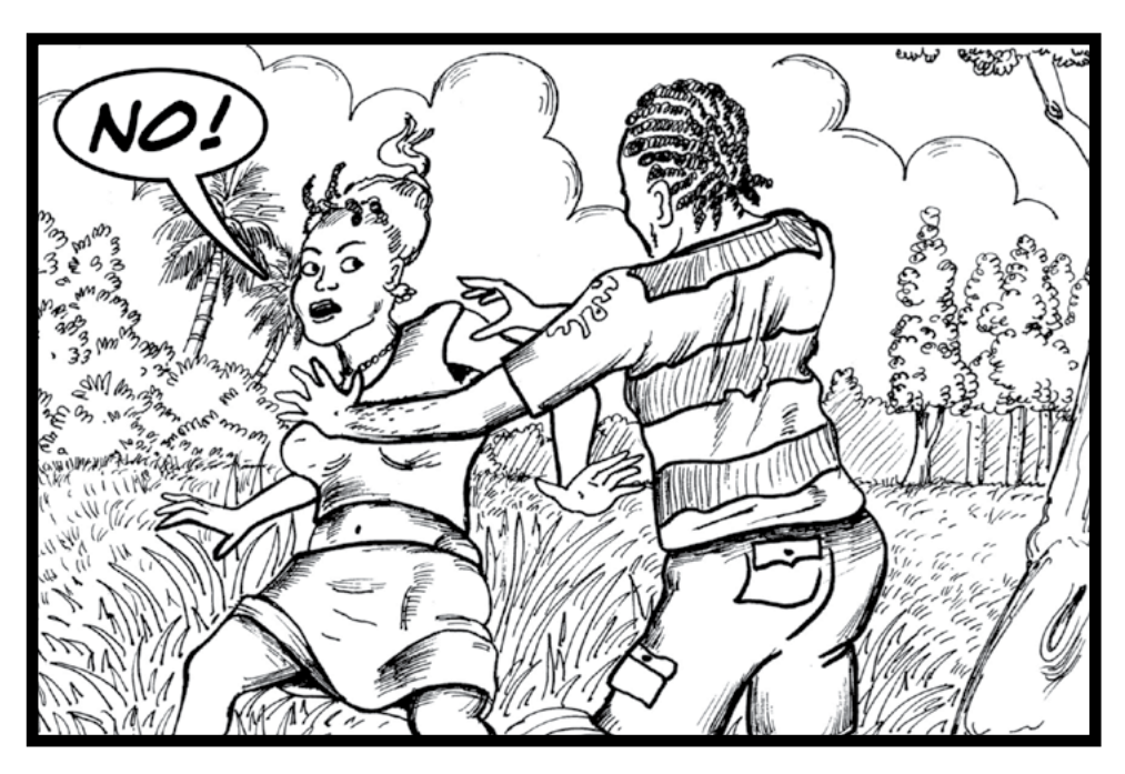
Safety, dignity and proper treatment for all.